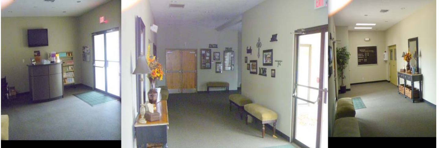
Our Foyer and Welcome Booth

The “ Connection ” circulation is now 200. Many receiving our newsletter are from other towns and states, which may have never seen Netherwood Park. The hope in this connection is that we may share our “fingerprint” of Netherwood by a pictorial view of our building, campus and personnel. We always have our “ Welcome ” mat out for you when in the Albuquerque area.