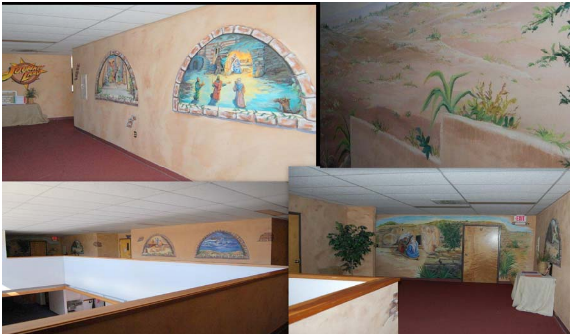
Journey Land-Children’s Bible Classes for ages Kindergarten thru 5 th grade